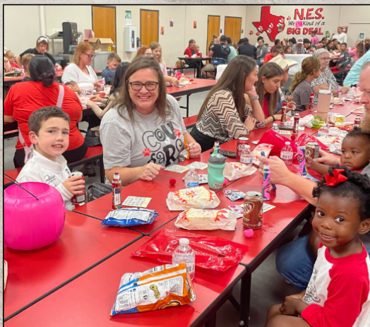
N.E.S. students and their families enjoyed a night of Bingo, trick-or-treating and snacks.