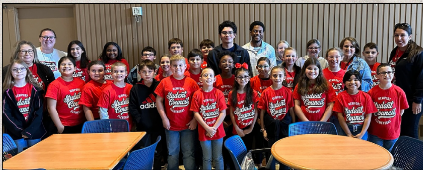
N.E.S. Student Council members toured Rice University and learned about college opportunities.