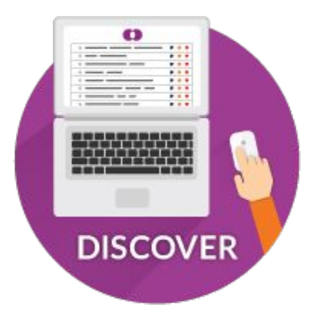
Everyone discovers what is important to the group