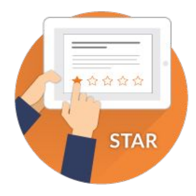
Participants consider ideas from others and add stars to the ones they like best