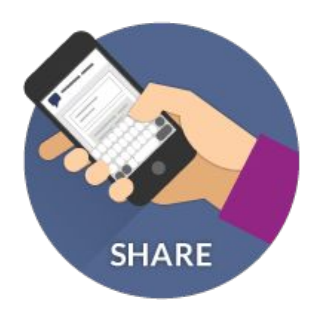
Participants share answers to open-ended questions